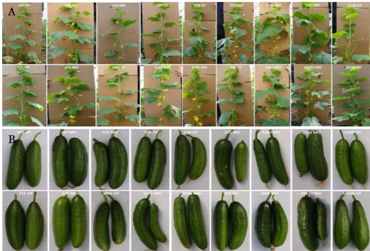
Figure. 1. General growth forms, leaves and flowers (A) and fruit morphology (B) of Cucumber genotypes used for diversity analysis.

Morphological plant characters including plant length, length of leaf blade, fruit length, fruit diameter and fruit stem length were analyzed in 18 selected cucumber genotypes (Fig. 1).