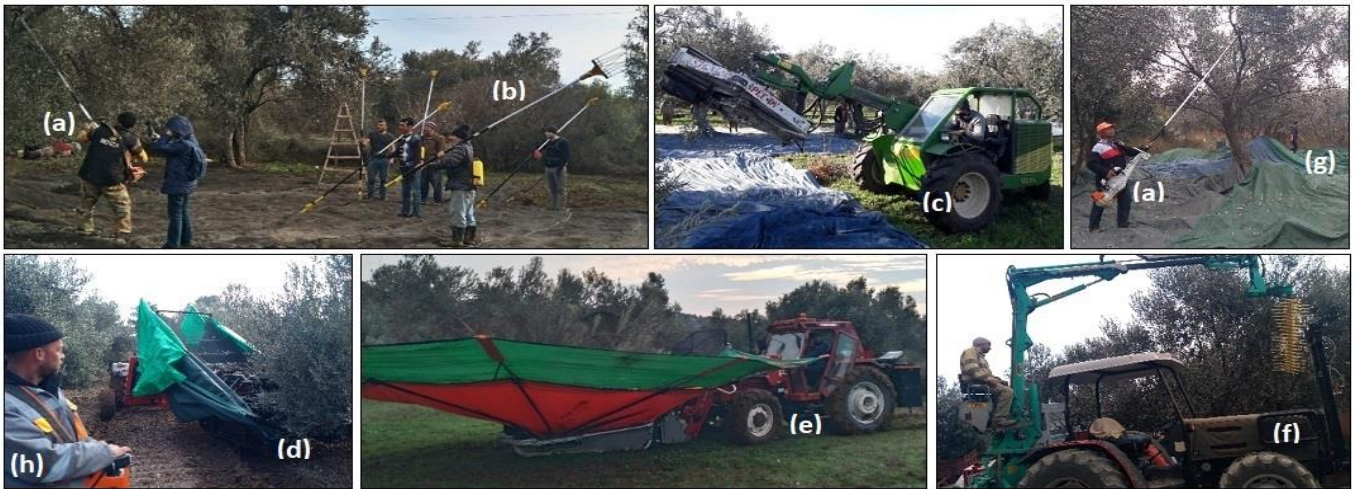
Figure 1. Images of olive harvesting machines used in the research. a) hook, b) flap, c) self-propelled trunk shaker, d) and e) tractor driven trunk shaker, f) tractor driven rotated flap, g) the other employee, h) operator

The study was conducted in the Marmara and Aegean Region of Turkey. The machines were selected in a variety to represent all the machines used in olive harvest and had different technical characteristics and different working principles according to the topography and tree form: hand-held types, self-propelled and tractor-driven (Figure 1).