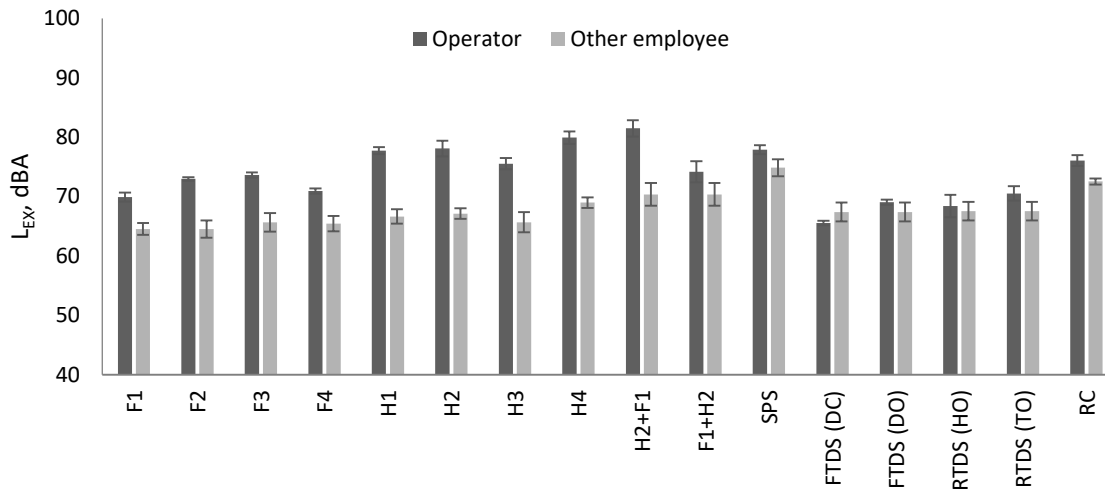
Figure 3. L_{EX} values of operators and other employees for all machines tested in the study Şekil 3. Tüm hasat faaliyetlerinde operatörler ve diğer çalışanlar için L_{EX} değerleri