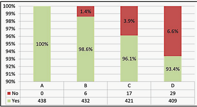
Figure 2: Practicing preventive behaviors.

D. I increased the frequency of cleaning and disinfecting items that can be easily touched with hands (i.e. door handles and surfaces).