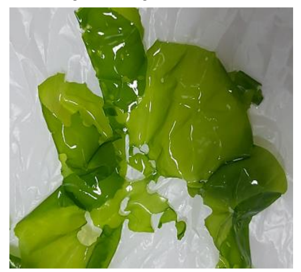
Figure 1. Green seaweed ( Ulva rigida ) collected from Giresun, Turkey.

The algaes were authenticated immediately after collection. The green seaweed and image microscope are shown in Figure 1 and Figure 2.