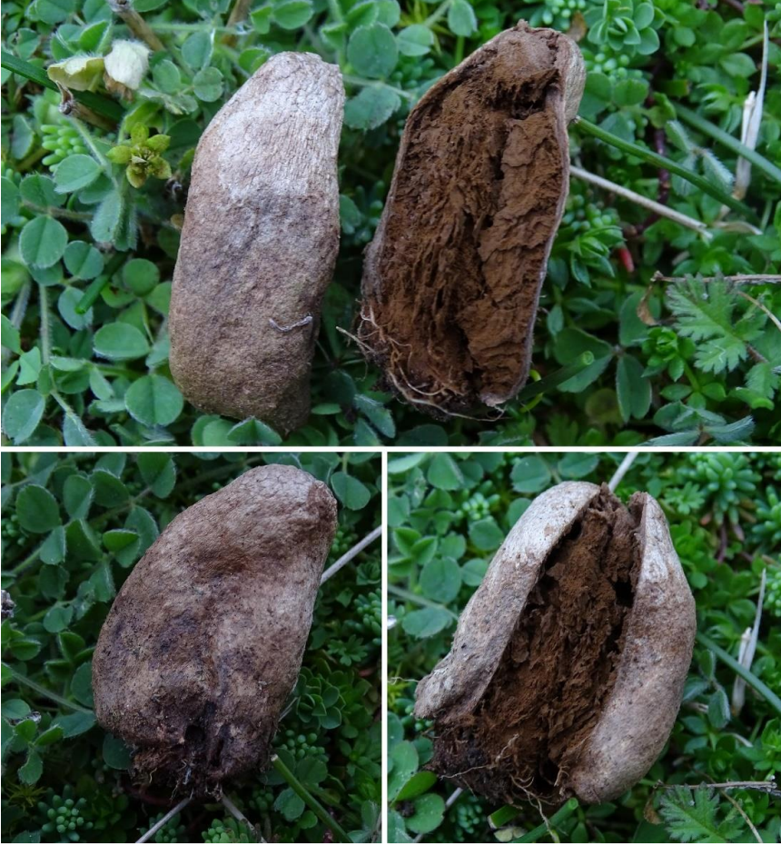
Figure 3. Basidiocarps of Chlorophyllum agaricoides Şekil 3. Chlorophyllum agaricoides 'in bazidiyokarları