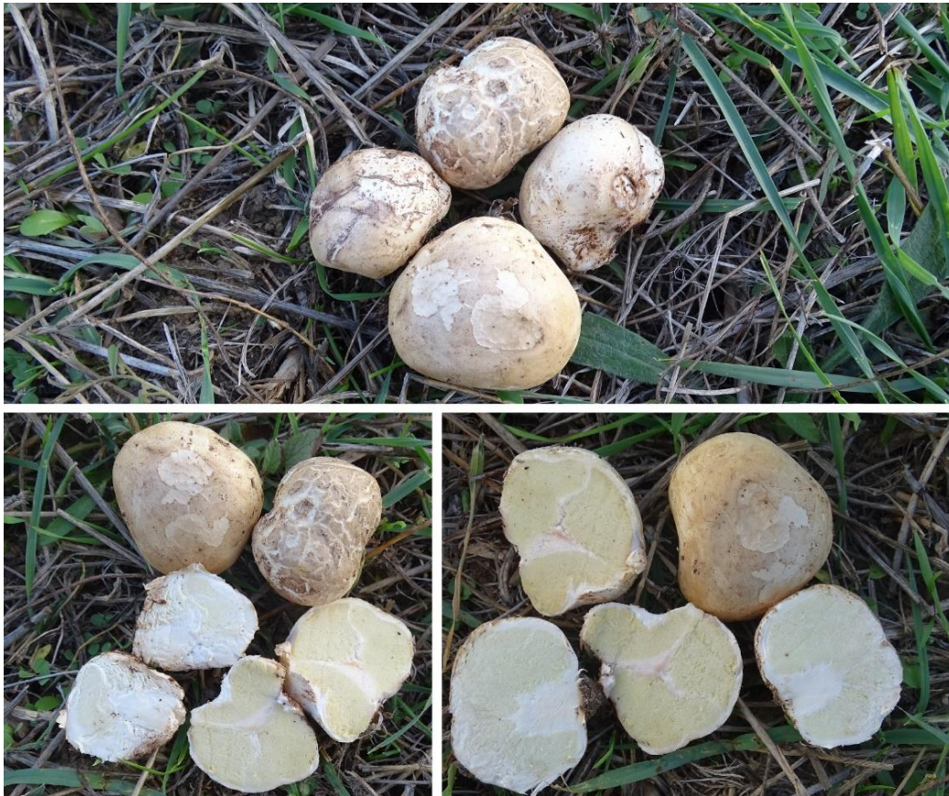
Figure 1. Basidiocarps of Chlorophyllum lusitanicum Şekil 1. Chlorophyllum lusitanicum 'ün bazidiyokarpları.

Specimen examined: İzmir, Kemalpaşa, Nazarköy Village, meadow, 38°22'N-27°26'E, 300 m, 13.10.2018, Yuzun 6779.