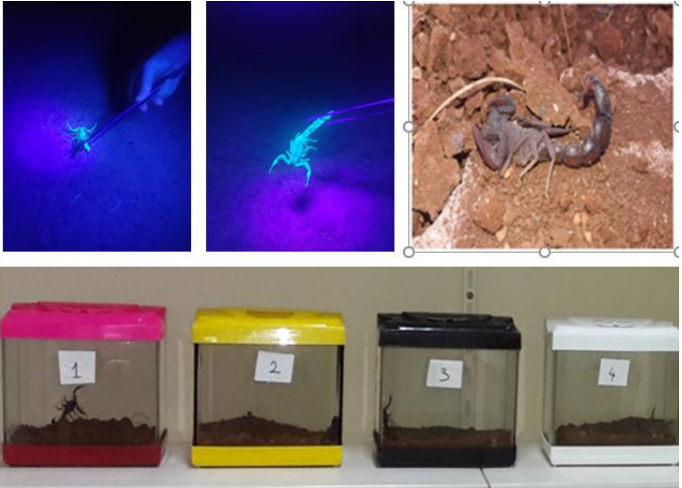
Figure 2. Images of A. crassicauda sampled in the field and living samples in the laboratory.

tanks with some soil, under 50-60% humidity, 26 \pm 2 °C of ambient conditions in Ecological Sciences Laboratory (Figure 2). Animals such as grasshopper, insect, fly were left in the tank to feed them. Samples that were collected dead were kept in glass jar with 96% ethanol.