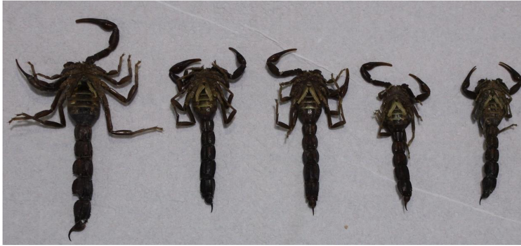
Figure 3. Preparation of samples for identification. Şekil 3. Tanımlama için numunelerin hazırlanması.