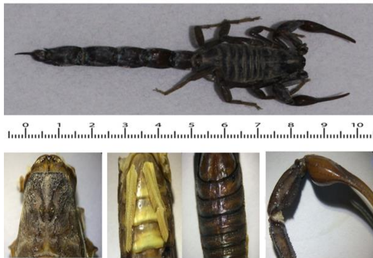
Figure 4. General appearance and body parts of A. crassicauda Şekil 4. Kalınkuyruklu Akrep'in genel görünümü ve vücut bölümleri.