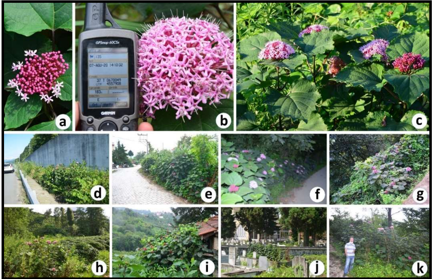
Figure 1. a: Blooming flowers; b: Coordinate; c: Habit; d-k: Habitats (d-g: Along the road, h: Edge of tea plantation, i: Garden, j: Cemetery, k: Woodland).

Şekil 1. a: Açmış çiçekler; b: Koordinat; c: Habitus; d-k: Habitatlar (d-g: Yol boyu, h: Çay bahçesi kenarı, i: Bahçe, j: Mezarlık, k: Orman).