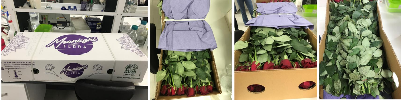
Figure 1. The cut roses were packaged in a way (placed in perforated cardboard boxes) that will minimize damage during transportation

company within the same hours, and they reached us within 22 hours by road. No cooling conditions are provided for bus transportation. It was ensured that the cut roses have as many leaves as possible, their leaves are not cleaned, and they are packaged in a way that will minimize damage during transportation (Figure 1). The experiment was set up by applying the cut flowers as soon as they arrived.