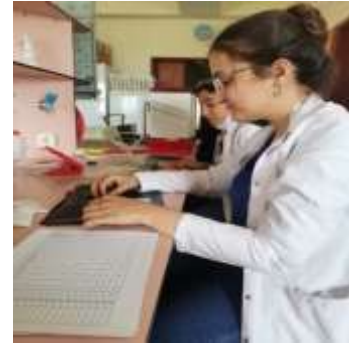
Figure 8. In the laboratory. on the 15th day after placing, while seeds are measured for germination and seedling development