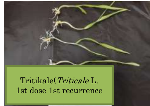
Figure 2. In tritikale 1st dose 1st Recurrence Şekil 1. 6. doz 1. tritikale nüksü