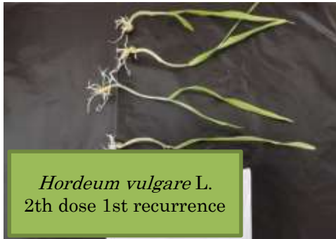
Figure 3. In barley 2th dose 1st recurrence Şekil 3. Arpada 2. doz 1. nüks