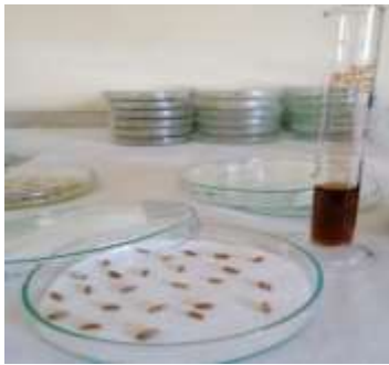
Figure 1. 6th dose 1st recurrence of tritikale Şekil 1. 6. doz 1. tritikale nüksü

In the experiment in cereal species, properties such as germination rate (GR) (%), radicle length (RL) (cm), plumule length (PL) (cm), seedling length (PL) (cm), seedling fresh weight (SFW) (g), seedling dry weight (SDW) (g) and seedling vigor index (SVI) were investigated. Images of the research are given below (Figure 1-8).