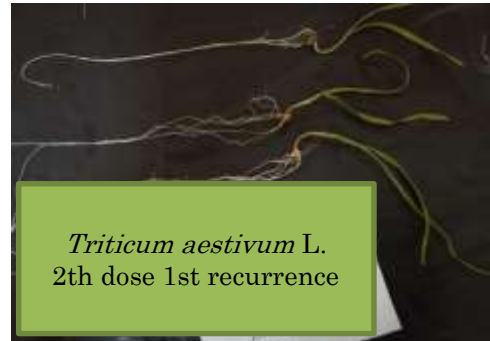
Figure 4. In wheat 2th Dose 1st Recurrence Şekil 4. Buğdayda 2. doz 1. nüks