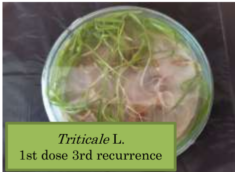
Figure 7. In triticale 1st dose 3th Recurrence Şekil 7. Tritikalede 1. Doz 3. nüks