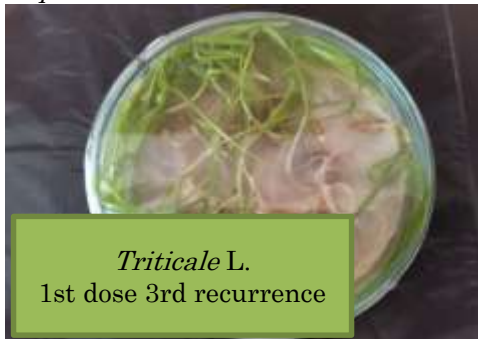
Figure 5. In tritikale 1st dose 3th Recurrence Şekil 5. Tritikalede 1. Doz 3. nüks