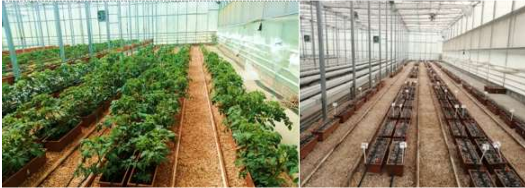
Figure 1. Trial setup, and post-planting view