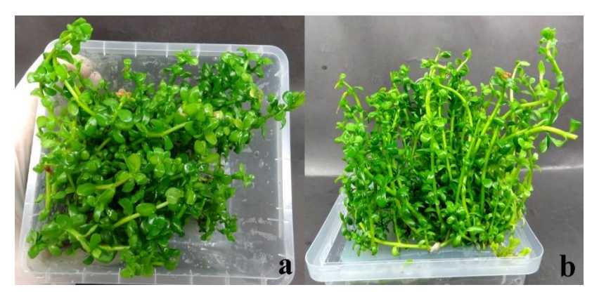
Figure 1. In vitro plant regeneration from shoot tip explants of B. monnieri (a,b) after 10 weeks of culture