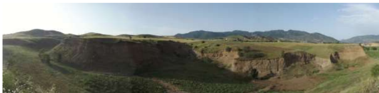
Figure 2. The colony site of the European Rollers

The average distance between breeding territories was 1.2 km (n=17, se=0.3, range=0.13-5.5 km) and 2 km (n=4, se= 0.6, range=1.3-3.8) in SEK and GOL, respectively. In SEY, there were only two solitary breeding pairs. The distance between these pairs was 7.8 km.