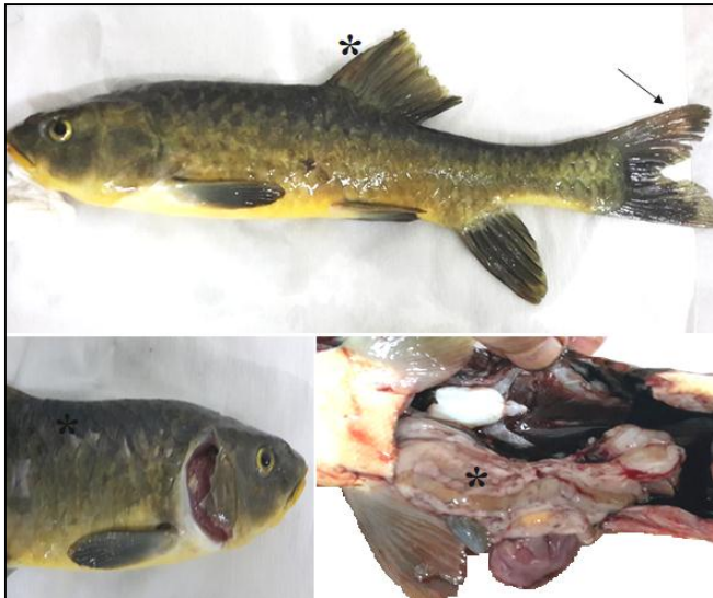
Figure 1. The loss of scales on the body surface of the diseased fish and hemorrhage on the fins (*) (a), necrosis in the gill (b), enlargement of the spleen and hemorrhage in the abdominal cavity and hyperemia in the visceral organs (*) (c)

period. A total of 20 bacterial isolates were obtained from these colonies, and these isolates were examined in 4 different groups based on their morphological, physiological and biochemical characteristics. The bacteria of the first isolate (n=5) were identified as Aeromonas sp. since they were Gram-negative, motile bacilli, gave a positive reaction to cytochrome oxidase and catalase tests and also were sensitive to O/129 test. Since isolate number 2 (n=5) was Gram-negative motility bacilli, gave a positive reaction to cytochrome and oxidase test and was sensitive to O/129 test, the isolated bacteria were identified as Vibrio sp. It was determined that isolates number 3 (n=5) and 4 (n=5) were Gram-positive, cluster forming, cocci shaped bacteria and also gave a negative reaction to cytochrome oxidase and a positive reaction to catalase. Therefore, these isolated bacteria were identified as Staphylococcus spp. According to the results of all biochemical tests, the isolated bacteria were identified as A. hydrophila (isolate 1), V. fluvialis (isolate 2), S. warneri (isolate 3), and S. capitis (isolate 4). All results obtained were confirmed by the API 20E and API STAPH kit. The morphological, physiological and biochemical characteristics of the isolated bacteria and their API profiles are presented in Table 1.