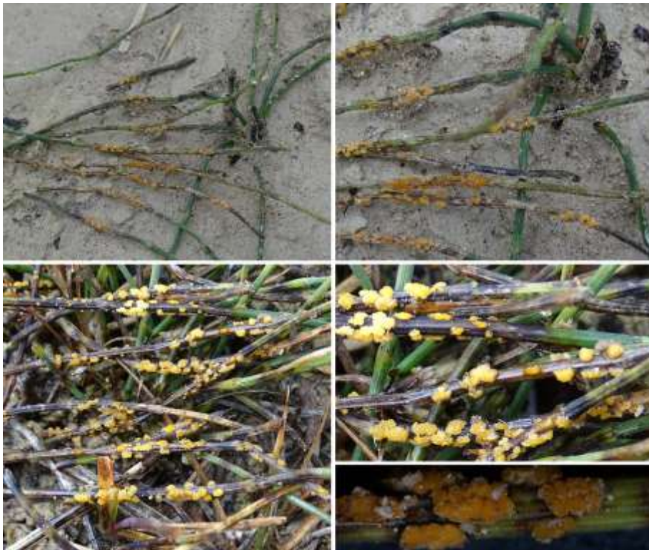
Figure 1. Ascocarps of Stamnaria americana Şekil 1. Stamnaria americana 'nin askokarları

TURKEY - Karaman, Zengen (Başharman) Village, near irrigation channel, on living stems of E. hyemale , 37°05'N-33°22'E, 1190 m, 04.05.2019, Yuzun 7394; Mersin, Silifke, Değirmendere Village, Göksu River bank, under Populus L. sp. and Salix L. sp., on living stems of E. hyemale , 09.11.2019, 36°24'N-33°48'E 40 m, Der-Kap 301; 36°26'N-33°46'E, 50 m, 27.11.2019, DerKap-395.