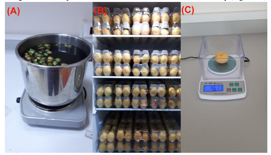
Figure 1. (A) Preparation of common poppy fruit extracts, (B) storage of fruit samples in chambers and (C) measuring of fruit weight with digital scale.