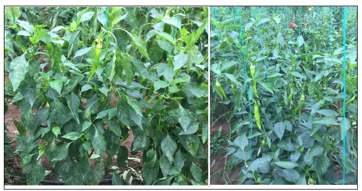
Figure 2. General view of the pepper plants in greenhouse A) Control B) Timorex Gold Şekil 2. Seradaki biber bitkilerinin genel görünümü A) Kontrol B) Timorex Gold