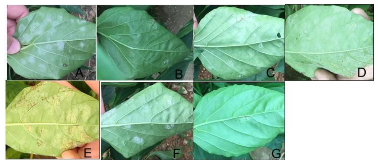
Figure 1. Pepper leaves in the greenhouse experiment in 2016 A) Control B) Timorex Gold C) Prev-Am D) Vitanal E) Seranade F) Regalia G) Luna Experience

* Mean values with different letters in the same columns denote significant differences (Tukey's Multiple Range Test; P \leq 0.05 . <sup>1</sup>Positive control