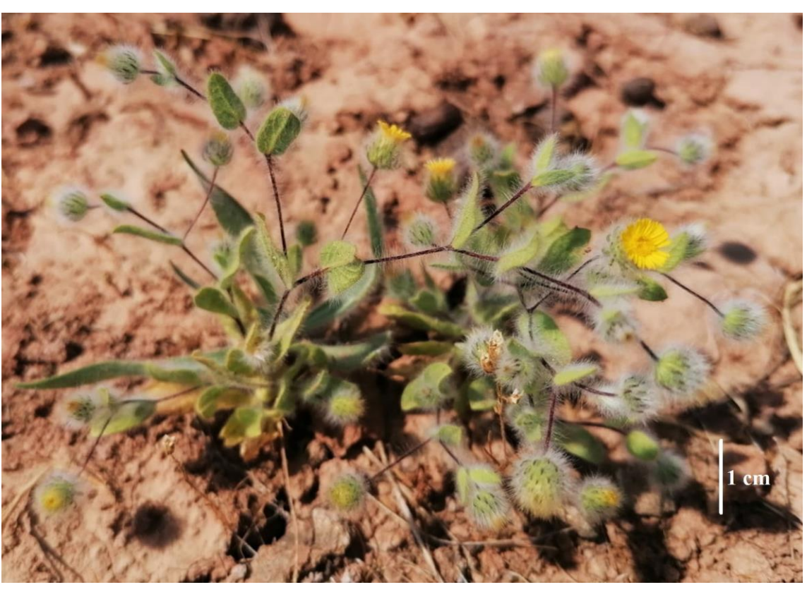
Figure 1. A view from the original habitat of Pentanema divaricatum . Sekil 1. Pentanema divaricatum'un original habitatından bir görüntü.

Typus: Verisimiliter, inter Baghdad et Aleppo, Olivier & Bruguiere s.n. , P.