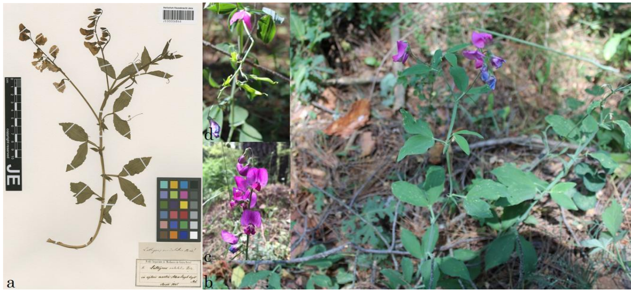
Figure 2 . Syntype specimen of L. undulatus (a) and live specimen (b: habitus, c: flowers, d: legumes) Sekil 2 . L. undulatus'un sintip örneği (a) ve canlı örneği (b: genel görünüş, b: çiçekler, d: meyveler)

An interesting new distribution area of the species has been determined with field surveys by us. In this research, it has been exhibited that the species also spread in a narrow area in C2 Muğla: Menteşe, Yerkesik (Figure 1). The species is distributed in the Pinus brutia Ten. forest in this locality. There are very few individuals in the population found in this newly detected locality. It has been determined by us that there are approximately 50 individuals in an area of approximately 1000 m<sup>2</sup>. This population, which is already distributed in a narrow area, is exposed to grazing pressure. New field studies should be carried out to determine whether the distribution of the population is limited to this area.