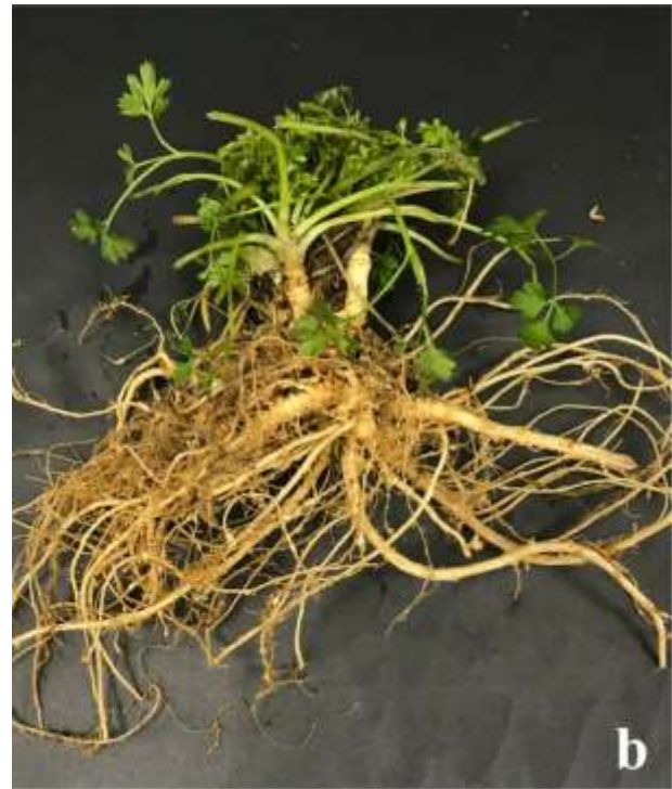
Figure 1. Parsley roots infected with Meloidogyne spp. a: Sample 13; b: Sample 94 Şekil 1. Meloidogyne hapla ile infekteli maydanoz kökleri a: Örnek 13, b: Örnek 94