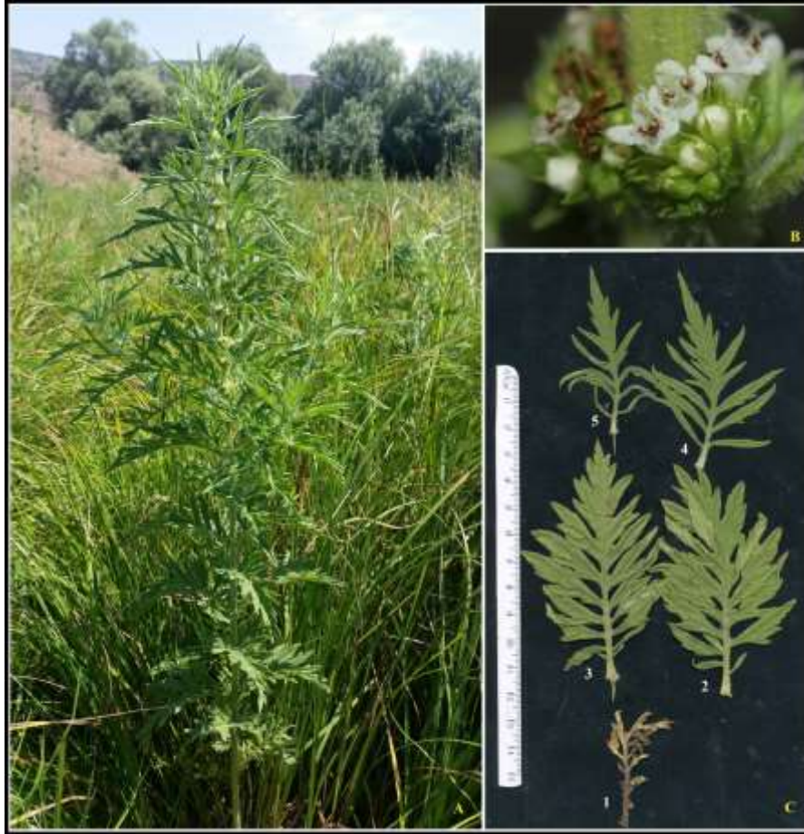
Figure 3. Lycopus exaltatus A- habit, B- close-up view of the flowers, C- Lower (1), median cauline (2,3,4) to upper cauline (5) leaves