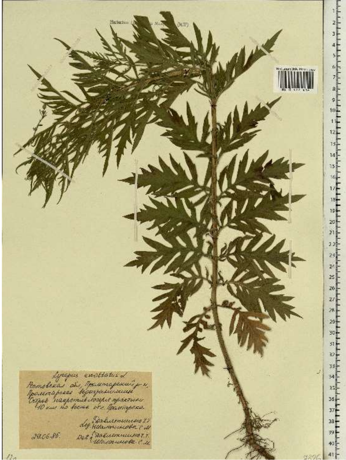
Figure 1. General view of Lycopodium exaltatum from Seregin 2023. Şekil 1. Lycopodium exaltatum 'un genel görünümü (Seregin 2023'den)

alba L. also draw attention along the streams. Taxa such as Atriplex laevis Ledeb., Bidens tripartita L., Bunium simplex (K.Koch) Klyuikov, Epilobium hirsutum L., Eremurus spectabilis M.Bieb., Chaerophyllum bulbosum L., Cirsium macrobotrys (K.Koch) Boiss., Cucubalus baccifer L., Gentiana cruciata L., Geranium divaricatum Ehrh., Inula salicina L., Juncus atratus Krock., Lepidium latifolium