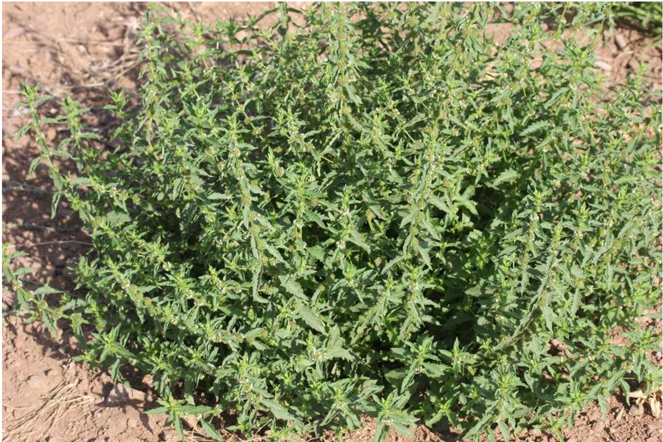
Figure 4. General view of Lycopus europaeus

Although Lycopus exaltatus is similar to L. europaeus ; it is better developed, robust and its leaves are pinnatifid or pinnatisect from base to apex; bracts 6-9 mm; calyx-teeth (1.3-)1.5(-2.0) mm; Lycopus europaeus leaves pinnatifid or pinnatisect at base, toothed or shallowly lobed at apex (Figure 4); bracts 3-5 mm; calyx-teeth c. 2 mm.