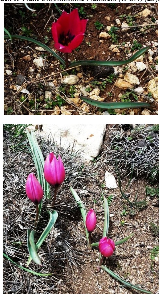
Figure 1: Habit of T. pulchella in the wild.

camera (Olympus Optical Co. Ltd., Tokyo, Japan). The short arm (S), long arm (L) and total lengths of each chromosome were measured and the relative lengths, arm ratios, and centromeric indices were from images of selected cells. determined Chromosomes were classified according to the nomenclature of Levan et al. (22). The intrachromosomal asymmetry index (A1) and the interchromosomal asymmetry index (A2) followed those of Romero-Zarco (23). The karyotype symmetry nomenclature followed Stebbins (24). Also, relevant literature the online chromosome number databases, Index to Plant Chromosome Numbers (IPCN) (25).