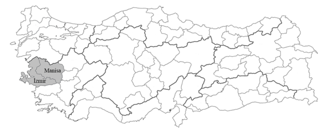
Figure 1. Surveyed area in the map of Türkiye