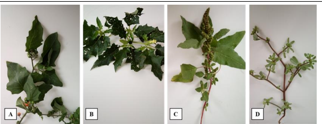
Figure 3. A. Chenopodium album L. B. Datura stramonium L. C. Amaranthus retroflexus L. D. Portulaca oleracea L.

In Manisa province, Amaranthus retroflexus L. (69%), Capsella-bursa pastoris (L.) Medik (49%), Portulaca oleracea L. (59%), Convolvulus arvensis L. (66%), Tribulus terrestris L. (88%), Raphanus raphanistrum L. (57%), Chenopodium album L. (56%), species are common. In contrast, in Izmir province, Avena fatua L. (85%), Chenopodium album L. (52%), Centaurea solstitialis L. (56%), the prevalence of Heliotropium europaeum L. (60%) weeds were found to be remarkably high. Two vineyard areas in Manisa were heavily infested with Datura stramonium L. However, Cuscuta spp. was not seen. Regarding density per 1 m<sup>2</sup> in vineyard areas, Stellaria media (L.) Vill (23), Avena fatua L. (13), Sorghum halepense (L.) Persian (8) stood out.