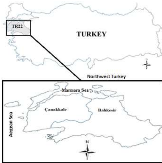
Figure 2. The map of study area Şekil 2. Araştırma alanının haritası

climate change effects, and there is no study performed related to this issue. The questionnaire for the study was completed from October 2023 to December 2023. Data collection was accomplished through a face-to-face interview technique. Ethics committee approval required for the study was obtained from the Ethics Committee of Çanakkale Onsekiz Mart University of School of Graduate Studies (2023-YÖNP-0672, Date: 05 October 2023, Decision no: 12/44).