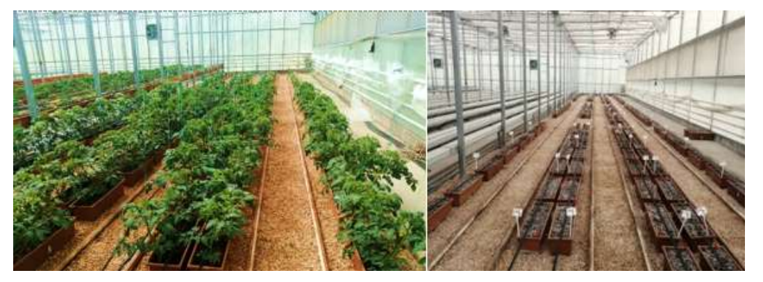
Figure 1. Trial setup, and post-planting view Şekil 1. Deneme kurulumu ve ekim sonrası görünüm

The process of fertilisation, and irrigation was conducted using a fully automated system. The requisite quantities for fertilisation were prepared by modifying the methodology set forth by Hoagland & Arnon (1950), with adjustments made according to the growth status of the plants in question. Following a ten-day period, the ratio of N:P:K:Ca: Mg was prepared as 2:1:1:3:1.5:1, and fertilisation was applied at 2.0 mmhos/cm EC until the onset of flowering, and 2.2 mmhos/cm EC thereafter. The fertilisation was applied in conjunction with the irrigation, and at each instance of irrigation. Ongoing measurements were made of the drainage outputs, and measures were taken to prevent the accumulation of salinity. Irrigation was conducted six times a day at equal intervals, with each irrigation occurring automatically for a duration of two minutes. To ascertain the impact of the treatments on tomato plants, the experiment was concluded in November. This was followed by a series of observations, including marketable yield, total yield, number of fruits, number of rejects, plant height, internode distance, pH, water-soluble dry matter content, titratable acid (TA), chlorophyll index (SPAD), fruit wet-dry weight, and leaf wet-dry weight.