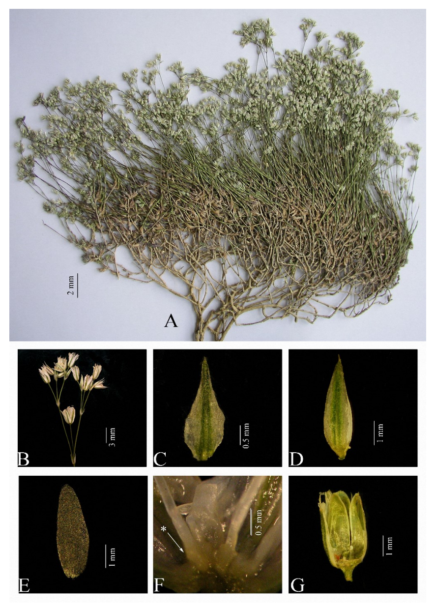
Figure 1. Minuartia setacea subsp. setacea var. setacea (Koç 2354). A– habit, B–cyme, C– bract, D– sepal, E– petal, F– (*) staminal gland, G– capsule.