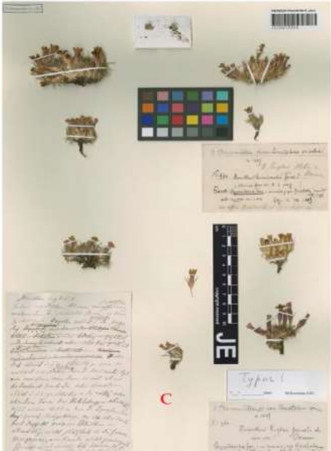
Figure 2. Lectotype of Dianthus carmelitarum (A), Dianthus cibrarius (B) and Dianthus engleri (C). Şekil 2. Dianthus carmelitarum (A), Dianthus cibrarius (B) ve Dianthus engleri (C)'nin lektotipi.