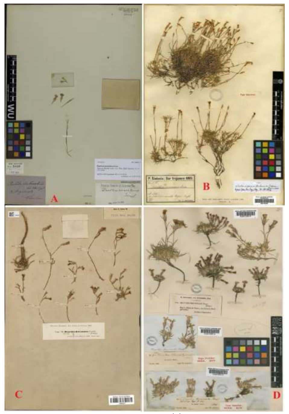
Figure 1. Lectotype of Dianthus acrochlonis (A), Dianthus arpadianus var. trojanus (B), Dianthus bitlisianus (C) and Dianthus brevicaulis (D, specimens on the bottom of sheet).