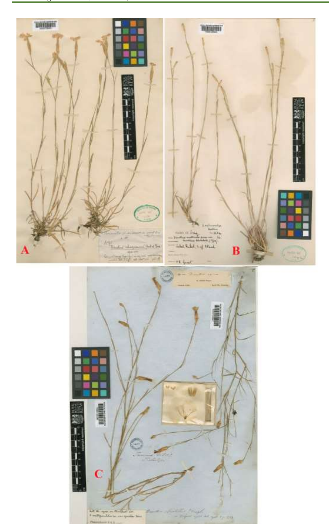
Figure 6. Lectotype of Dianthus setisquameus (A), Dianthus siphonocalyx (B) and Dianthus striatellus (C). Şekil 6. Dianthus setisquameus (A), Dianthus siphonocalyx (B) ve Dianthus striatellus (C)'un lektotipi .