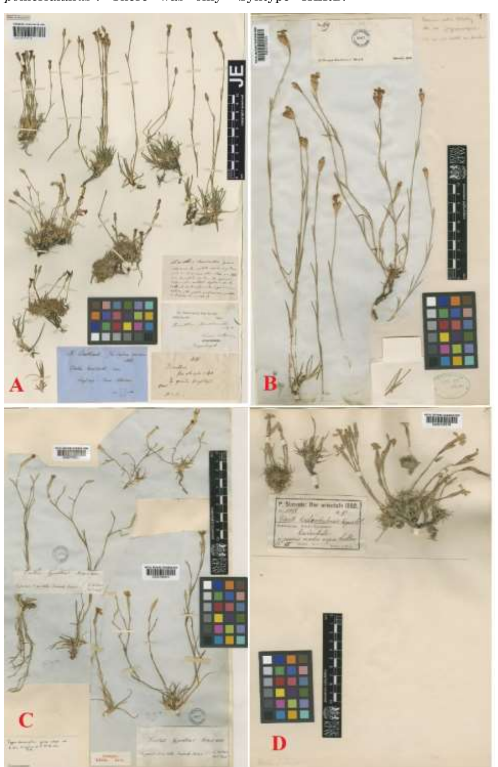
Figure 3. Lectotype of Dianthus haussknechtii (A), Dianthus hymenolepis (B), Dianthus hypochlorus (C, specimens on the bottom right of sheet) and Dianthus kastembeluensis (D).

Dianthus lydus Boiss., Diagn. Pl. Orient. 1(1): 20 (1843)!