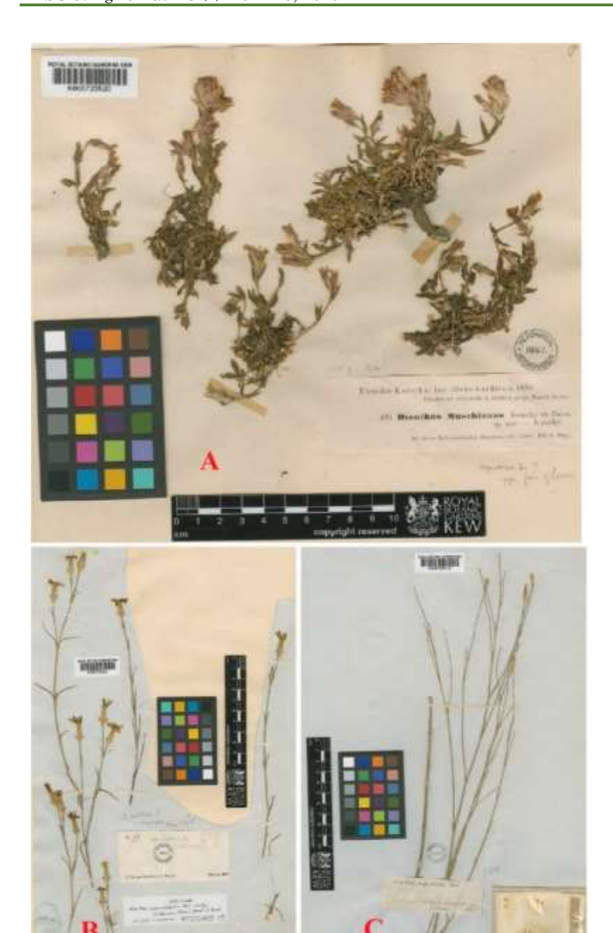
Figure 5. Lectotype of Dianthus muschianus (A), Dianthus pallens var. oxylepis (B) and Dianthus polycladus (C). Şekil 5. Dianthus muschianus (A), Dianthus pallens var. oxylepis (B) ve Dianthus polycladus (C)'un lektotipi.

Other syntype specimens: "In m. Elbrus pr. Derbend., 5 Jul. 1843, Kotschy 445" (BM [BM000572326] Virtual image!).